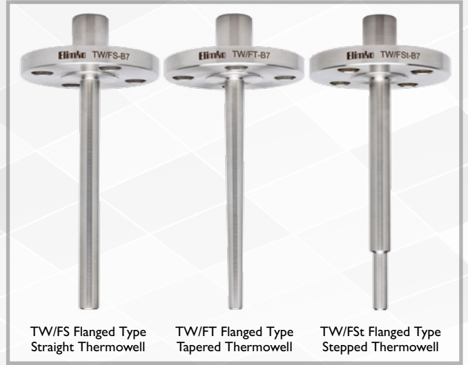
TW/FS Flanged Type Straight Thermowell TW/FT Flanged Type Tapered Thermowell TW/FS t Flanged Type Stepped Thermowell