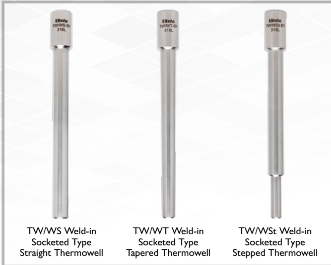
TW/WS Weld-in Socketed Type Straight Thermowell TW/WT Weld-in Socketed Type Tapered Thermowell TW/WS t Weld-in Socketed Type Stepped Thermowell